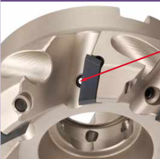
5N6R-XXR20 With Coolant

Coolant directed across insert face at cutting edge