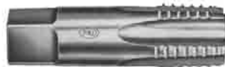
Cut Thread Interrupted, List No. 2179

These taps are standard in American Standard Pipe form (NPT), American Standard Pipe form (NPTF) and Aeronautical (ANPT). The first few threads on an interrupted thread pipe tap are left full.