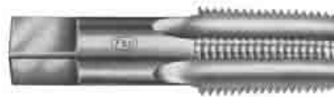
List No. 177

These taps are standard in cut thread right hand American Standard Pipe form.