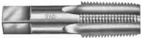
Cut Thread Regular, List No. 2177

These taps are standard in American Standard Pipe form of thread.