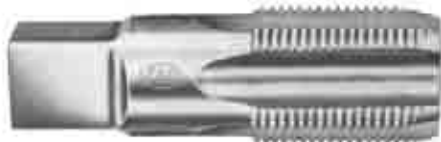
Cut Thread, List No. 2178

These taps are standard in cut thread right hand American Standard Thread form in plug style only.